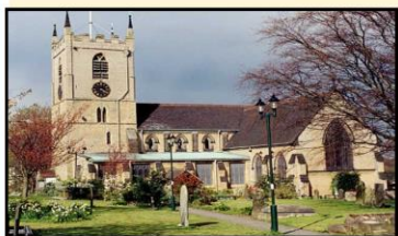
St. Mary Magdalene, Hucknall

The Parish Church of St. Mary Magdalene, Hucknall and Newstead Abbey Historic House and Gardens