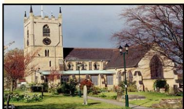
St. Mary Magdalene, Hucknall

The Parish Church of St. Mary Magdalene, Hucknall and Newstead Abbey Historic House and Gardens