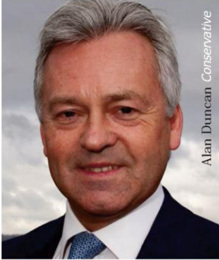
Alan Duncan Conservative

Question your candidates for the Rutland & Melton Constituency