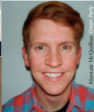
Alastair McQuillan Green Party