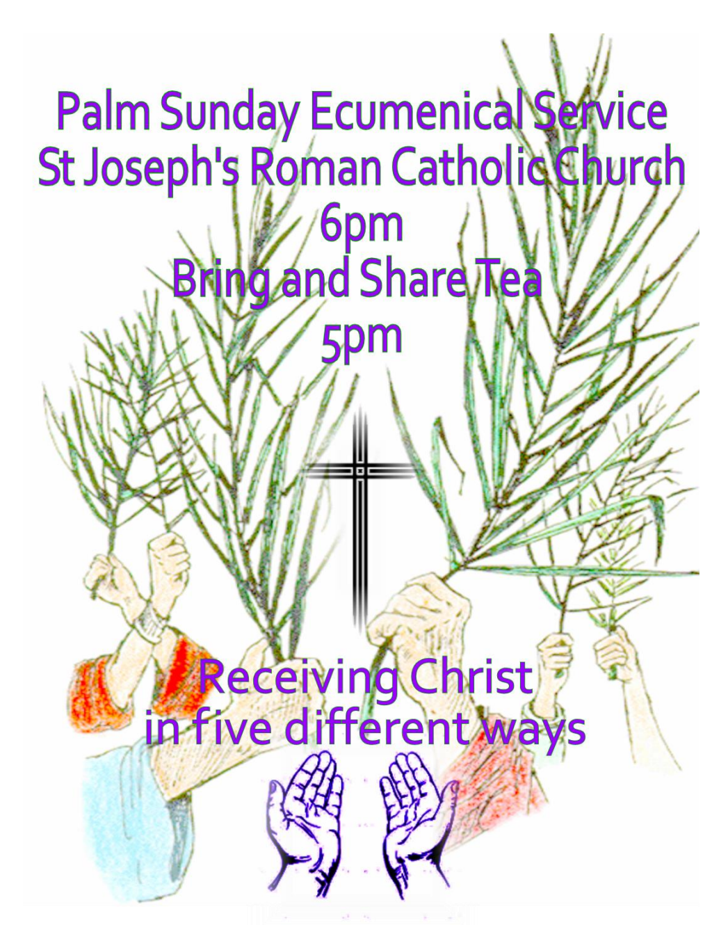
Churches Together in Oakham and District