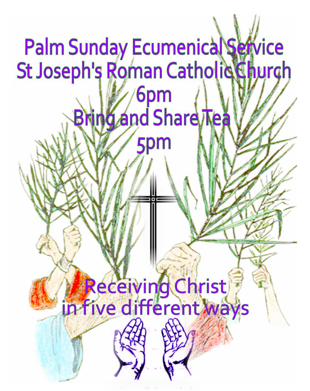
Churches Together in Oakham and District