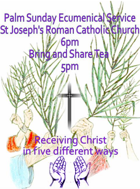
Churches Together in Oakham and District