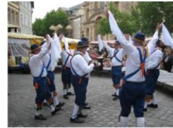
The Anker Morris Men

Sign up on list on table near South Door, All Saints' Church, Oakham