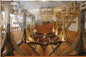
Tithe Barn Restaurant Excellent Food

Adult £4.50 Concession £4.00 Child £3.00 Family (2+2) £ 13.00