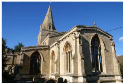
All proceeds to St John's Church