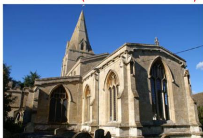
All proceeds to St John's Church