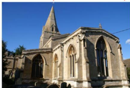
All proceeds to St John's Church