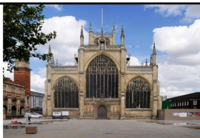
Hull Minster with Trinity Market on the left. Historic but recently transformed Trinity Square full of interest or sit and relax awhile.