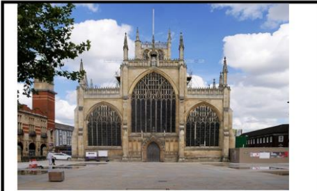
Hull Minster with Trinity Market on the left. Historic but recently transformed Trinity Square full of interest or sit and relax awhile.